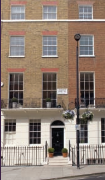
8 Connaught Street W2

Prestigious and exclusive property refurbishment Architectural design and planning Interior finishings and designs Construction build and management